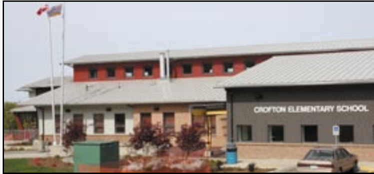
The brand new elementary school in Crofton demonstrates a love for the community and it's children.